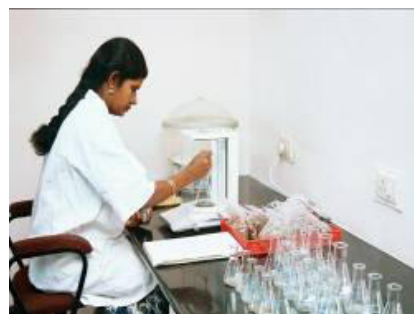
Sample processing for analysis