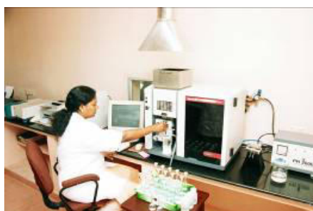
Instrument Analysis in Atomic Absorption Spectrometer