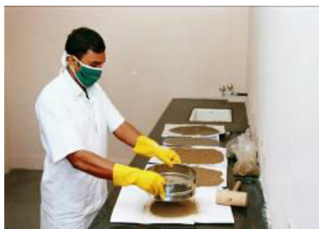
Sample Preparation for Soil Analysis