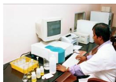
Instrument Analysis in UV-Visible Spectrophotometer